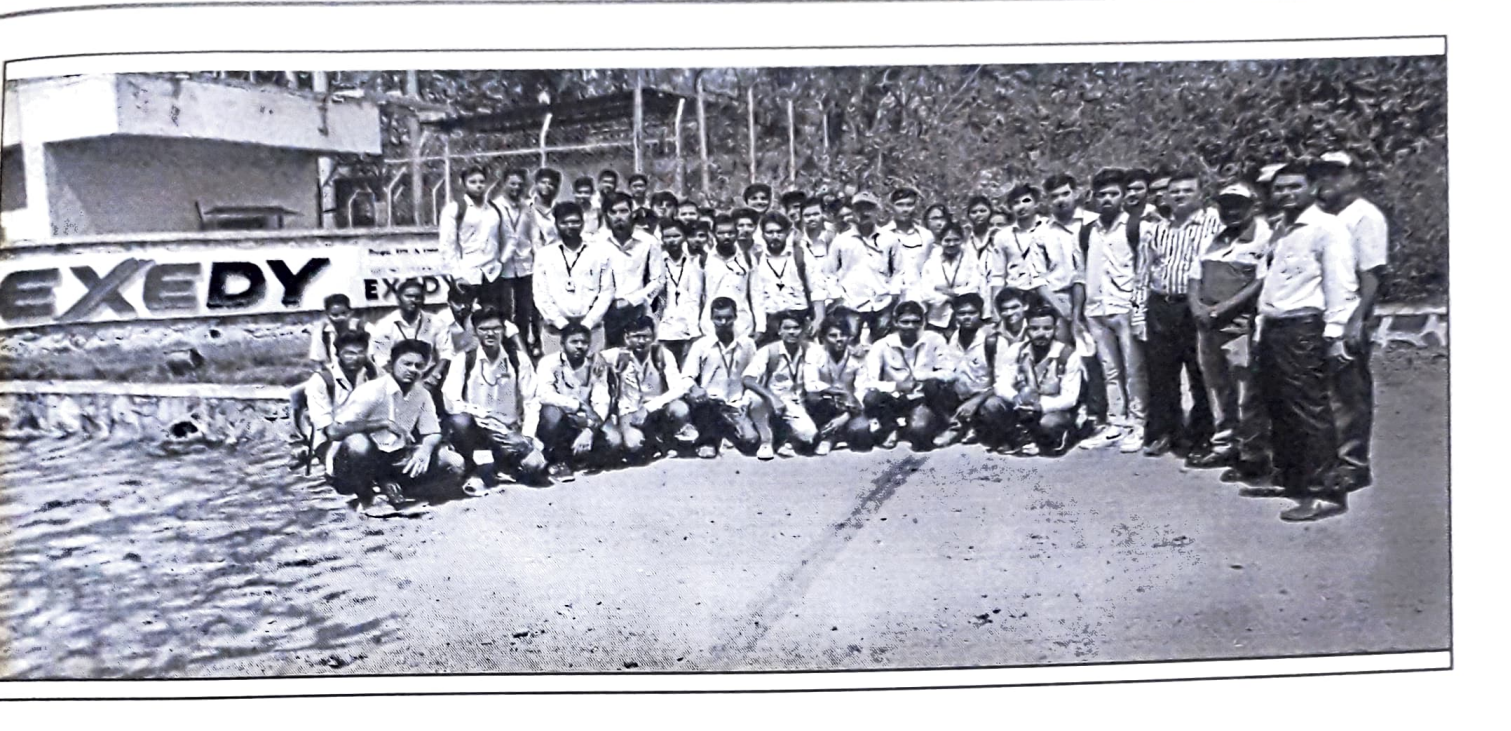
Pic.I: Group Photo of students, faculties and HR manager